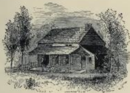
POE'S COTTAGE AT FORDHAM

NEW YORK A. C. ARMSTRONG & SON 714 BROADWAY