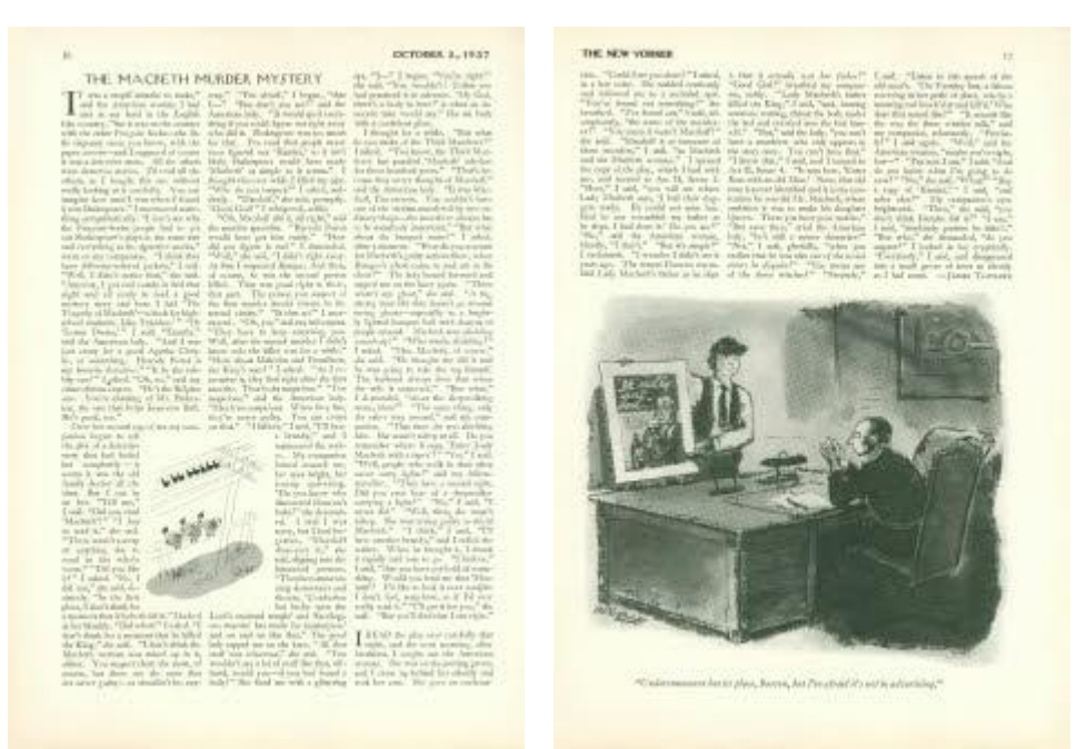
Страницы журнала «New Yorker» с рассказом Тэрбера (1937)

http://www.newyorker.com/archive/1937/10/02/1937\_10\_02\_016\_TNY\_CARDS\_000169728